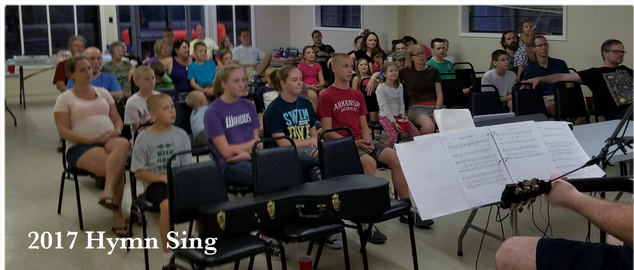
2017 Hymn Sing

There will be no Fellowship Lunch in December due to the annual Church Christmas Party. This year's party will be held on Sunday, December 3rd, beginning at 5:30 pm at the church. The meal will be catered by Two Sisters. Menu options and sign ups will be announced in the coming weeks. Mark your calendars!